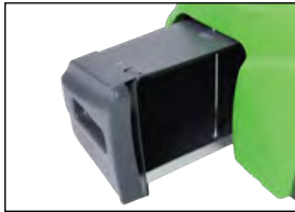
LARGE FRONTAL WASTE TRAY